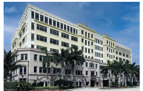
Mizner Park, Boca Raton, FL