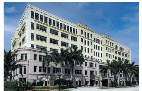
Mizner Park - Boca Raton, FL