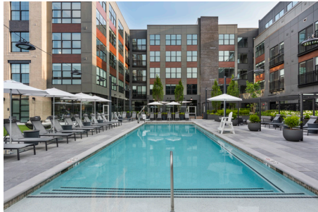
Gables Old Town North, Alexandria, VA