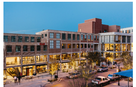
Westside Provisions District, Atlanta, GA