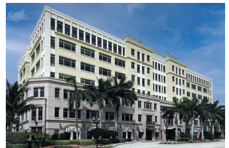
Mizner Park, Boca Raton, FL