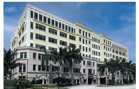
Mizner Park - Boca Raton, FL