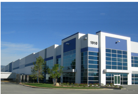
Southgate 3, San Bernardino, CA

Investment Pipeline Underwritten Annually