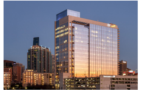
One Victory Park, Dallas, TX