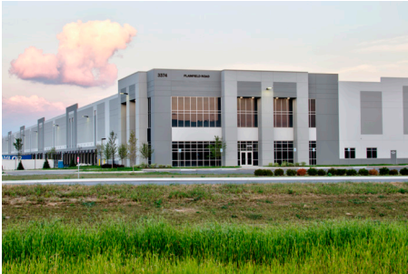
Greenparke 2, Indianapolis, IN