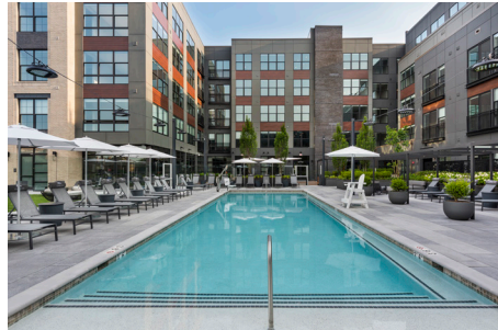
Gables Old Town North, Alexandria, VA