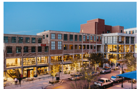
Westside Provisions District, Atlanta, GA