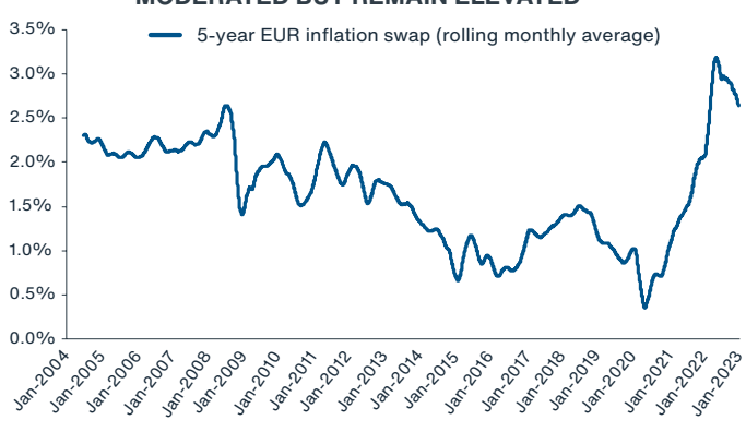
FIGURE 3: LONG TERM INFLATION EXPECTATIONS HAVE MODERATED BUT REMAIN ELEVATED